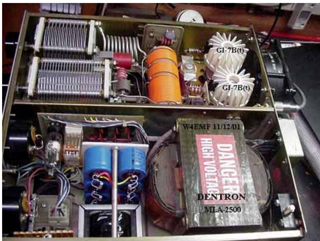
GI7BT installation in an MLA-2500, View 1

Pictures of an MLA-2500 Conversion made by W4EMF