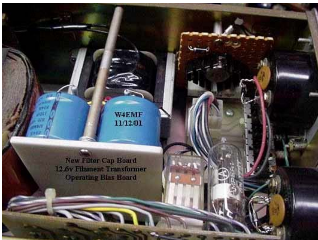
MLA-2500 Power Supply