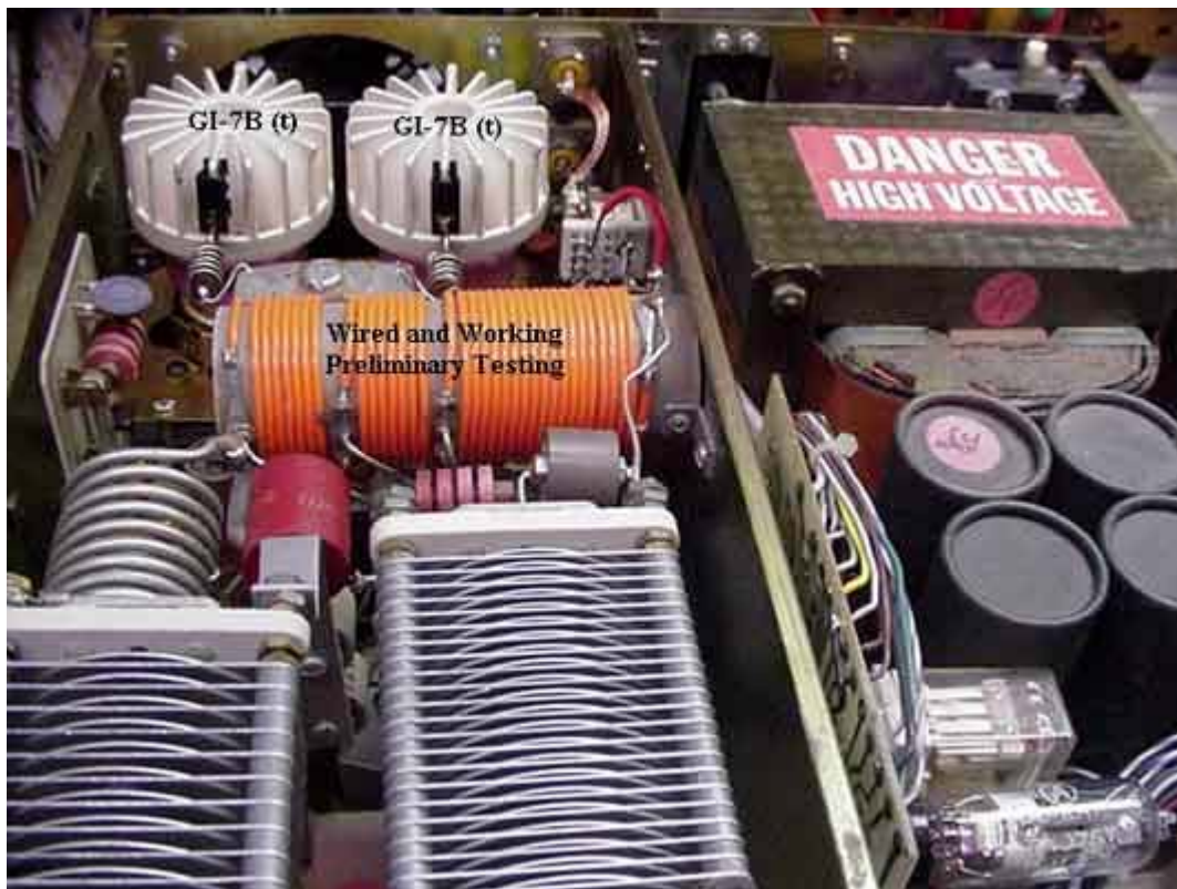
6L7BT installation in an MLA-2500, View 2