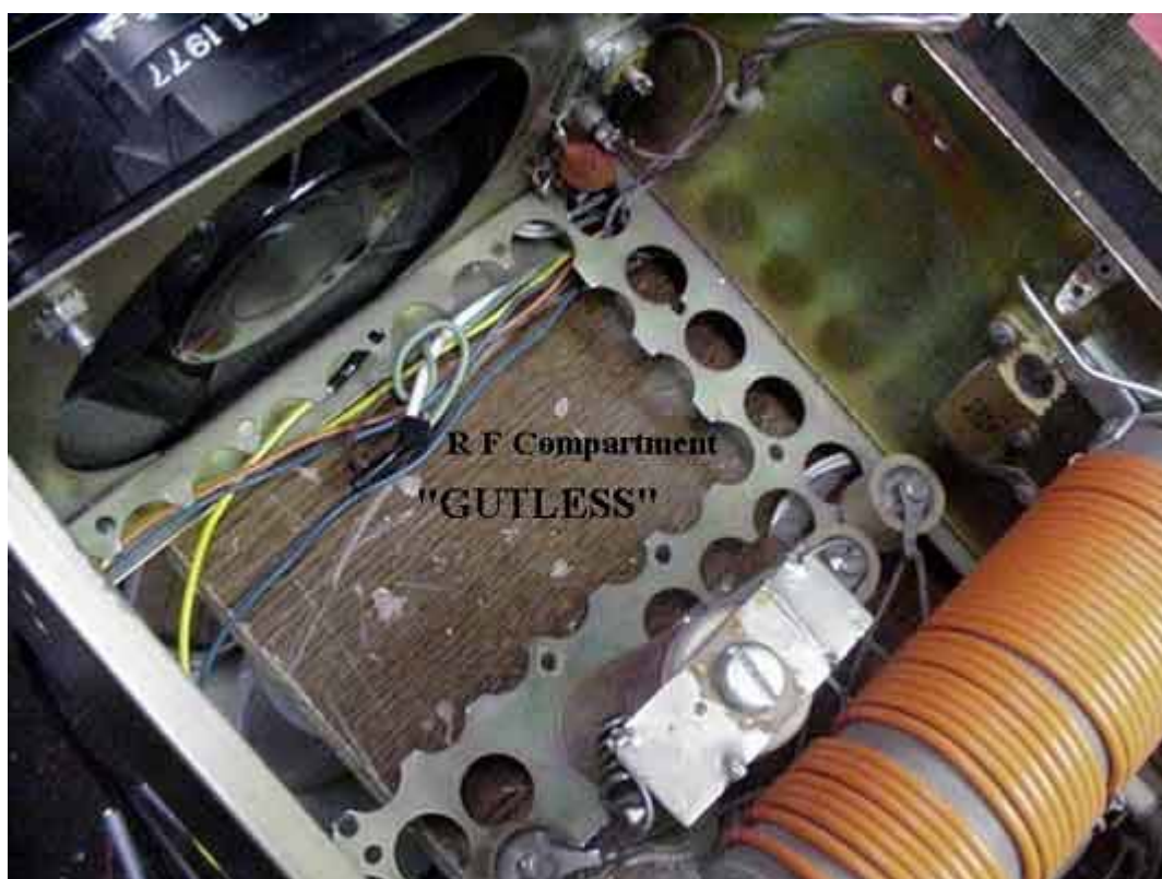
MLA-2500 RF Section Empty