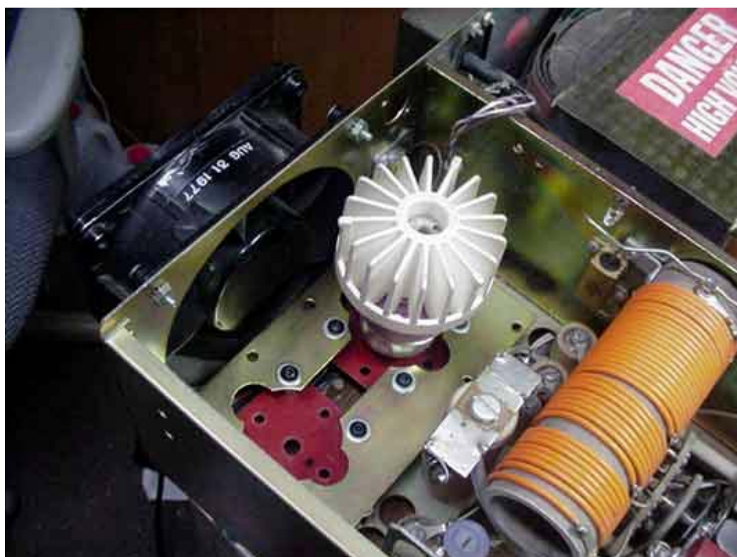
Tube Socket Plate installation