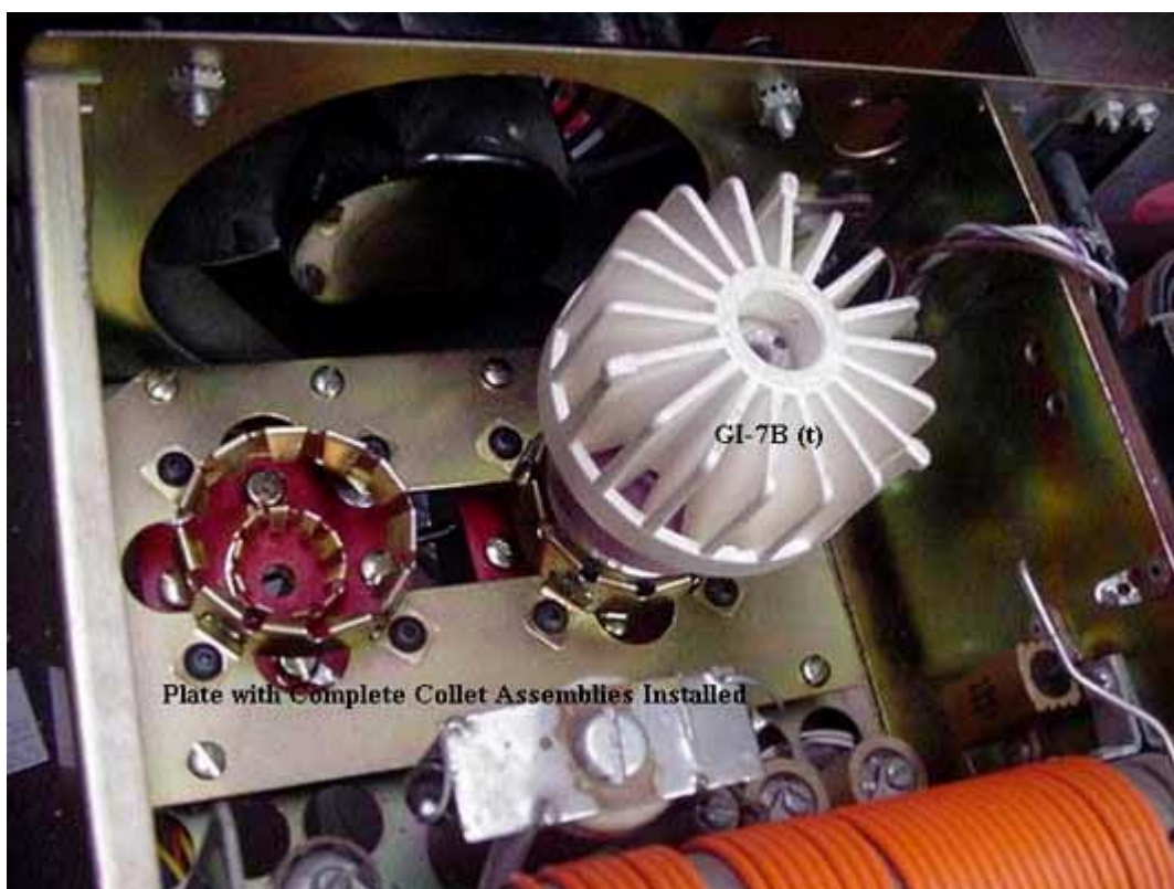
GI7BT Tube Socket Plate