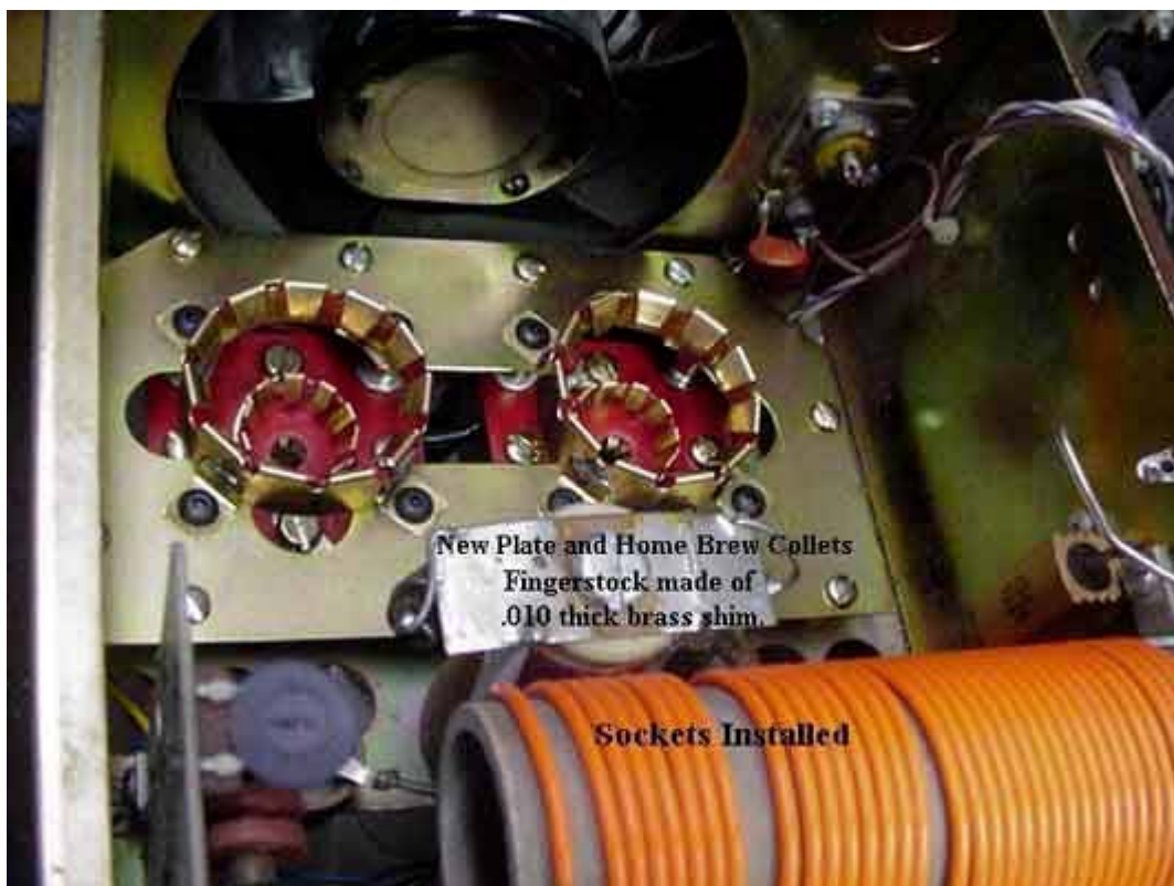
GI7BT Sockets Installed